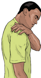
Joint and muscle pain