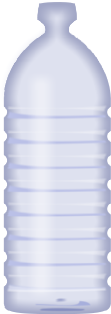
1.5 liter water bottle

Make chlorine solution every day. If chlorine solution is more than 1 day old, throw it away.