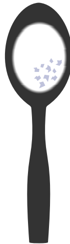
A little less than 1 TABLESPOON