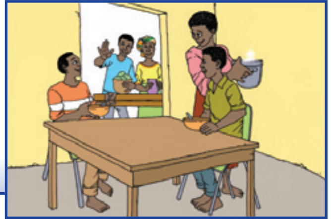
KPɔma wie bi heinyuisia ma