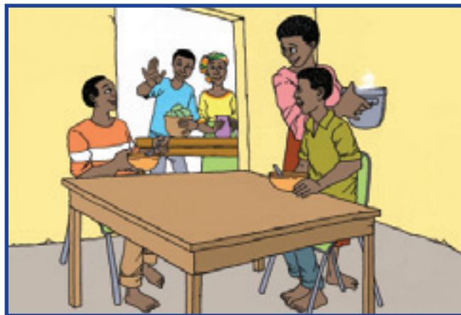
KPɔma wie bi heinyuisia ma