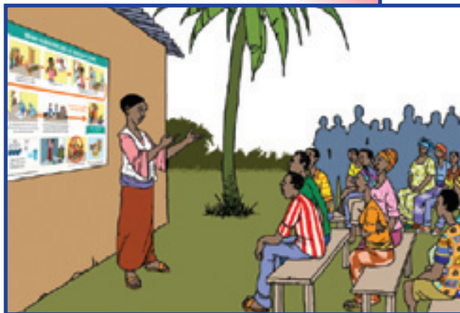
Kpɔma wie bi nguwei ma